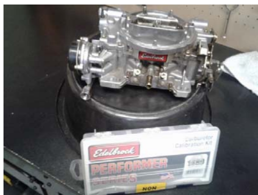
EDELBROCK "PERFORMER" CARBURATOR 1411 - 750 CFM ELECTRIC CHOKE METERING ROD KIT INCLUDED $100.00